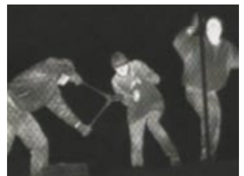
With the Sentry II you can zoom in quick and easy to identify potential alarm situations. Even in total darkness objects can be detected at distances of over 2 km.