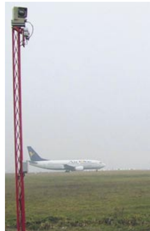
One of the Sentry II infrared cameras at Turin airport.

Sentry II, Mounted on a breakable coupling. The system consists of an uncooled thermal imager with an integrated and programmable Pan/Tilt and a daylight TV camera.