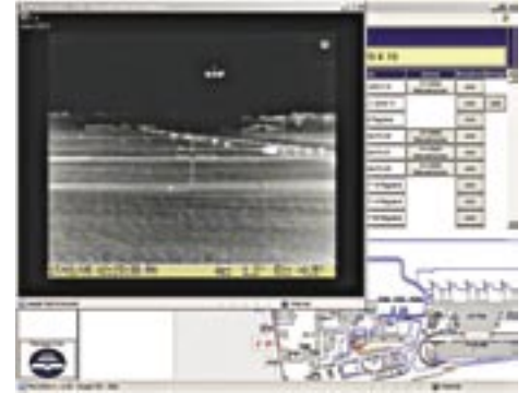
Image from Sentry II in IR mode.