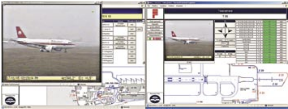
Images from Sentry II in TV mode. Control commands are well visible.