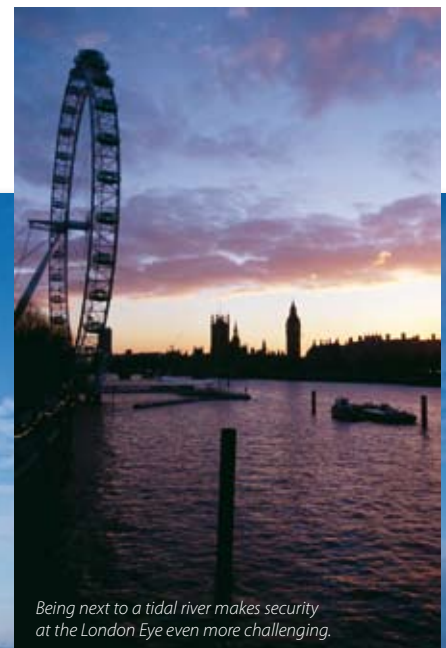
Being next to a tidal river makes security at the London Eye even more challenging.

For more information about thermal imaging cameras or about this application, please contact: