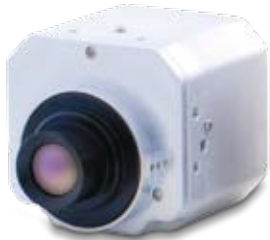
The FLIR Systems Photon™

Since the opening, and even during construction, security measures have been extremely tight at the London Eye. Also today, the Merlin Entertainments Group, sole owner of the London Eye, owning 51 attractions in 12 countries, takes security extremely serious.