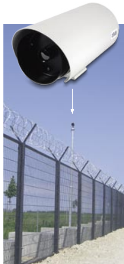
Twenty-two FLIR Systems SR-35 thermal imaging cameras were installed along the eleven km long fence

Safety and security measures in place are usually top secret before and during events of these types. It is