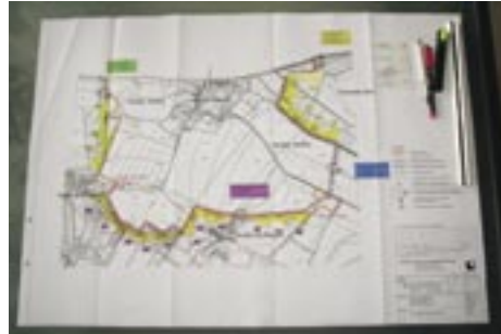
The security perimeter for the G8 summit

But not only the cameras and equipment for control rooms was installed by Siemens. A part of the area to be monitored consisted of really dense forest. In order to make sure that no one was entering this area, Siemens installed over 3,200 meters sensor wires in the forest soil. An alarm would go off if someone entered the forest.