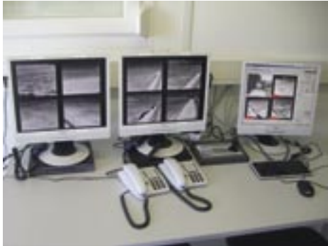
Part of the control room

The 2007 summit took place close to the Baltic Sea. Off the coast, a 32 km exclusion zone was put in place - making it impossible for boats to pass by anywhere near Germany's seaside summit. A two-mile long net in the water made it impossible for more adventurous protesters to swim secretly to the summit location.