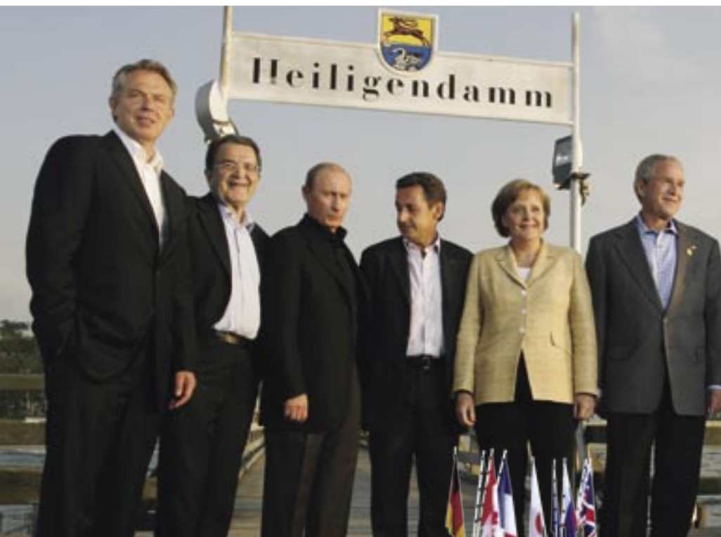
The heads of State of the G8 and Mr. Barroso